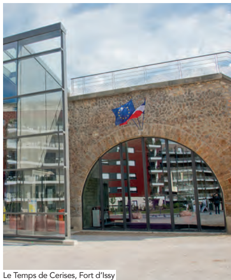
Le Temps de Cerises, Fort d'Issy

During the 1970s the city was hit by de-industrialisation, opportunity was taken to attract company headquarters in communication and multimedia technologies. The city has witnessed an unmatched economic development, doubling the number of jobs and attracting other company headquarters. Issy has succeeded in becoming an economically and demographically dynamic city.