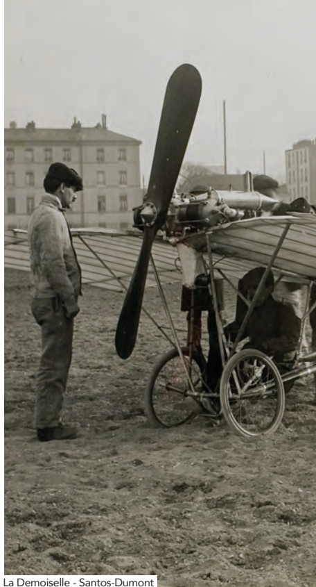
La Demoiselle - Santos-Dumont

With the war, the activity of the aeronautic construction workshops developed further, increasing the industrial potential of the Region of Paris.