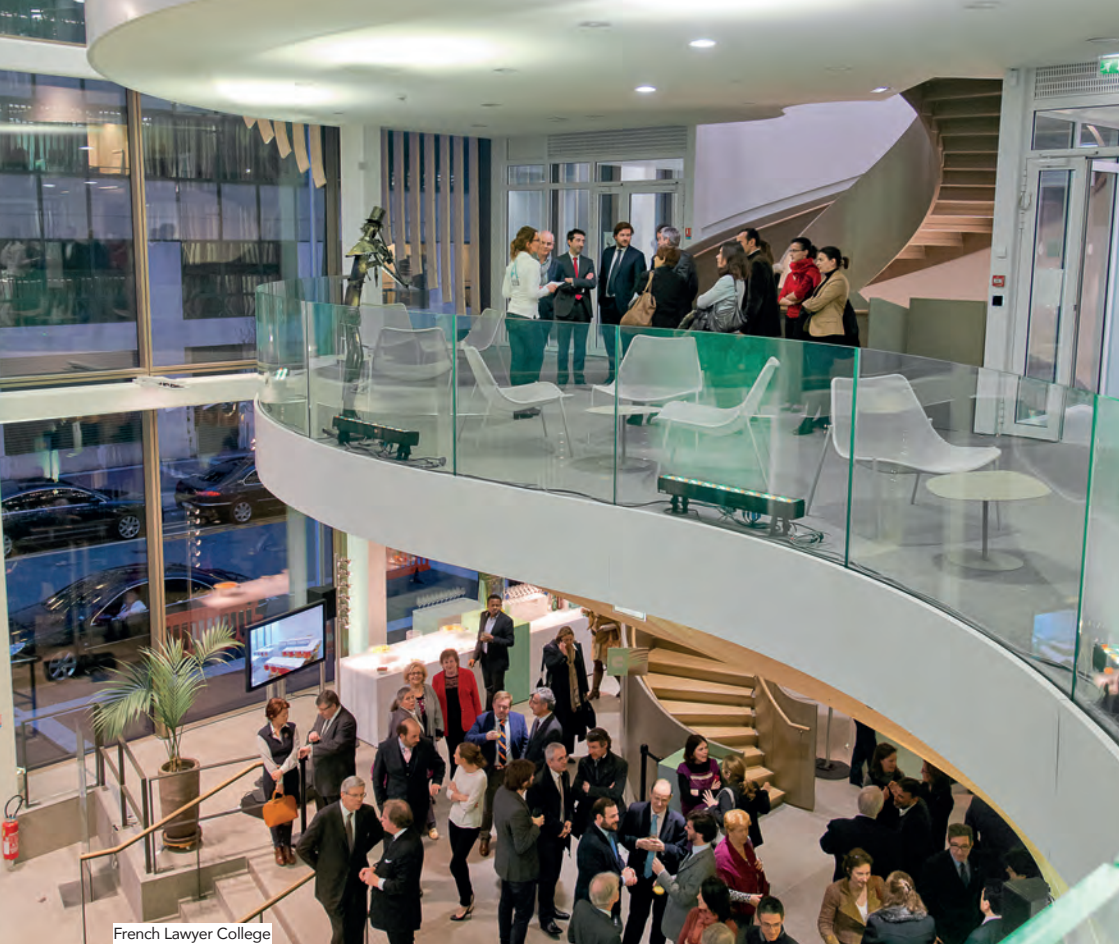
French Lawyer College