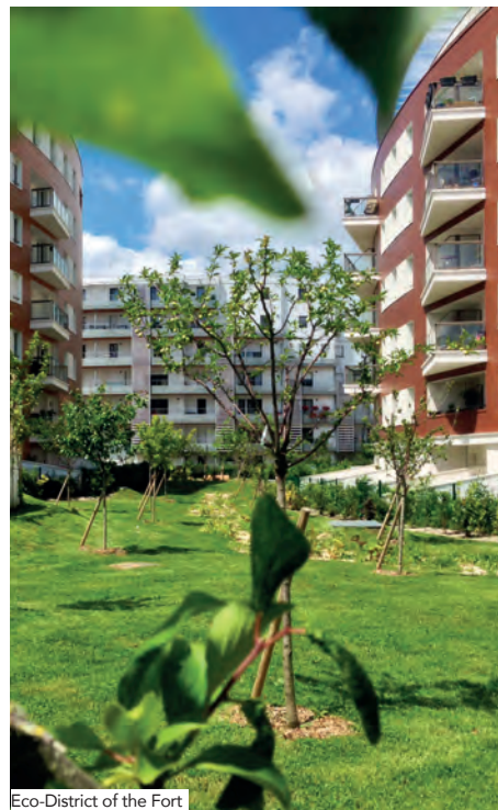
Eco-District of the Fort