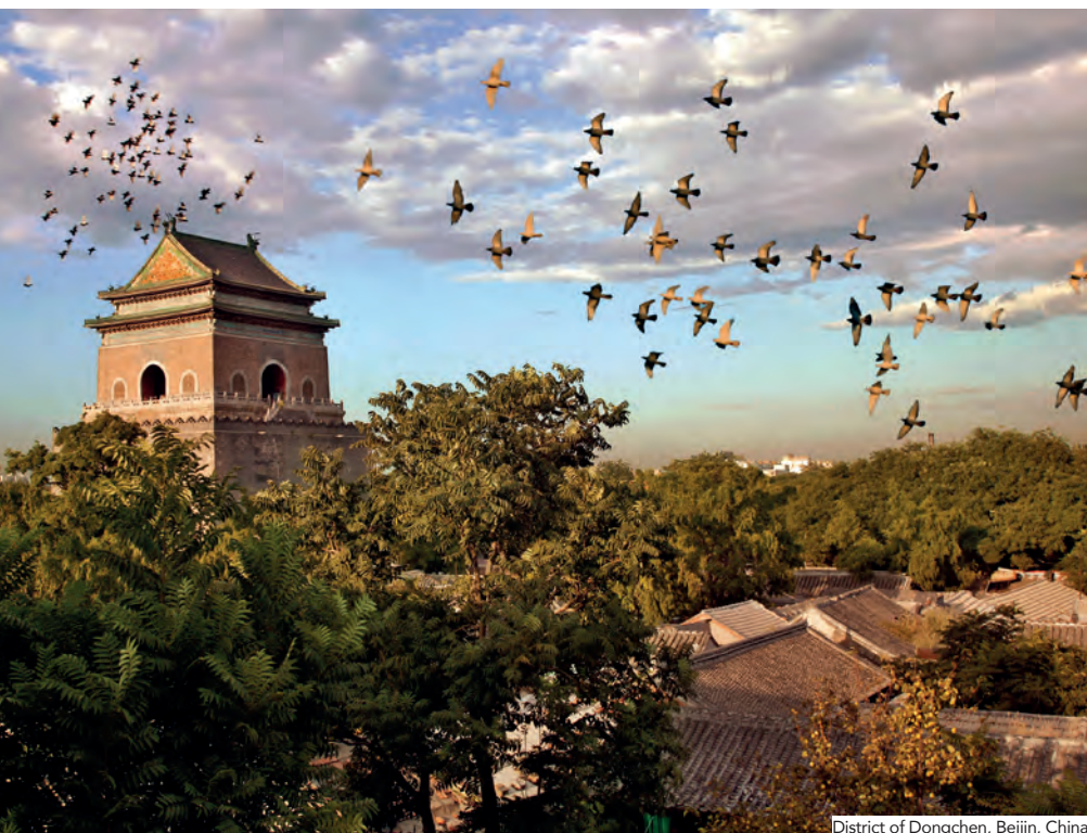
District of Dongchen, Beijing, China