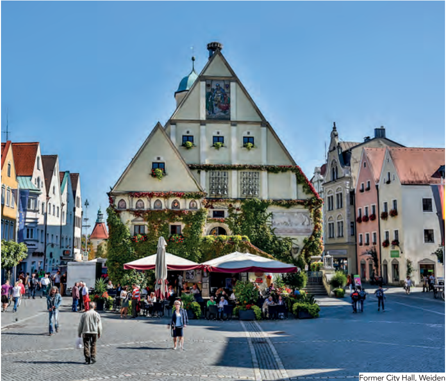
Former City Hall, Weiden